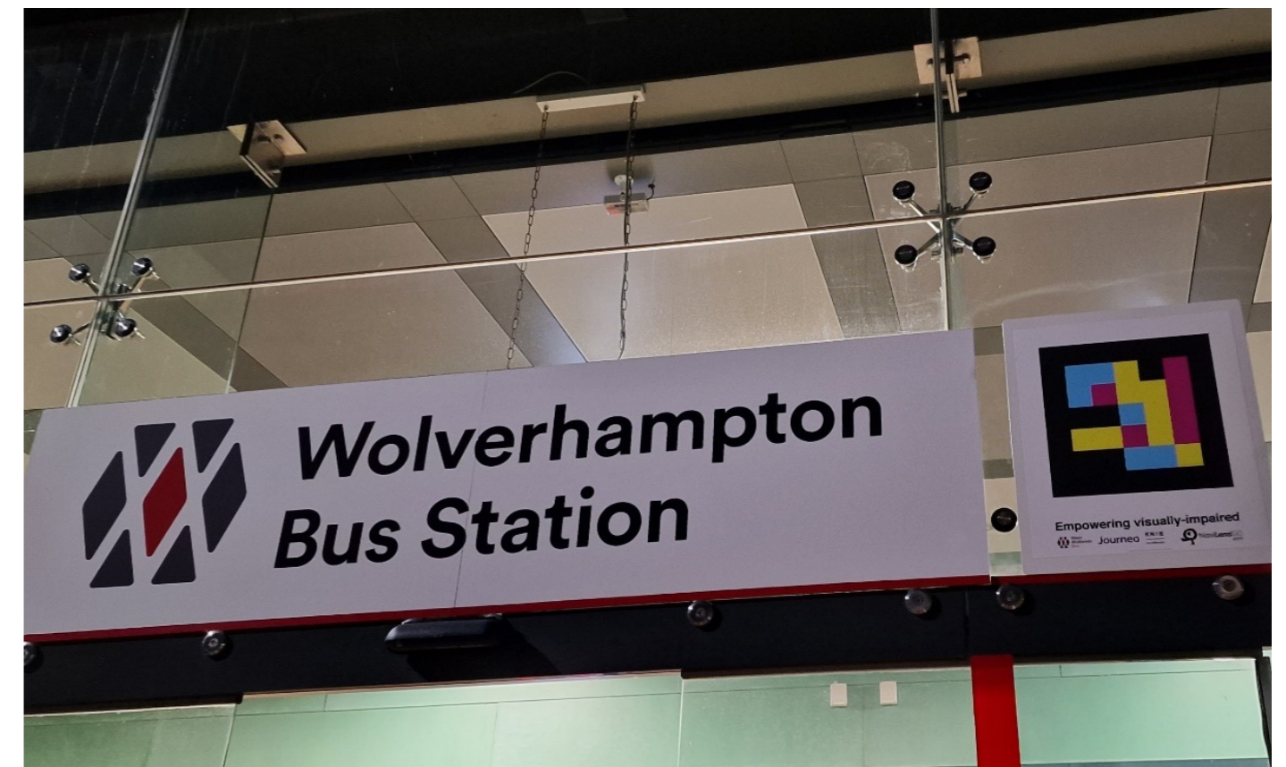
Image of Wolverhampton Bus Station sign

You can also access information through the NaviLens GO app, which provides more visual information for passengers who have low vision or are fully sighted, enabling anyone to access the same information.