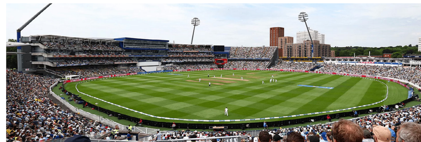
Image of the Edgbaston Cricket Stadium

These events are not open to the public.