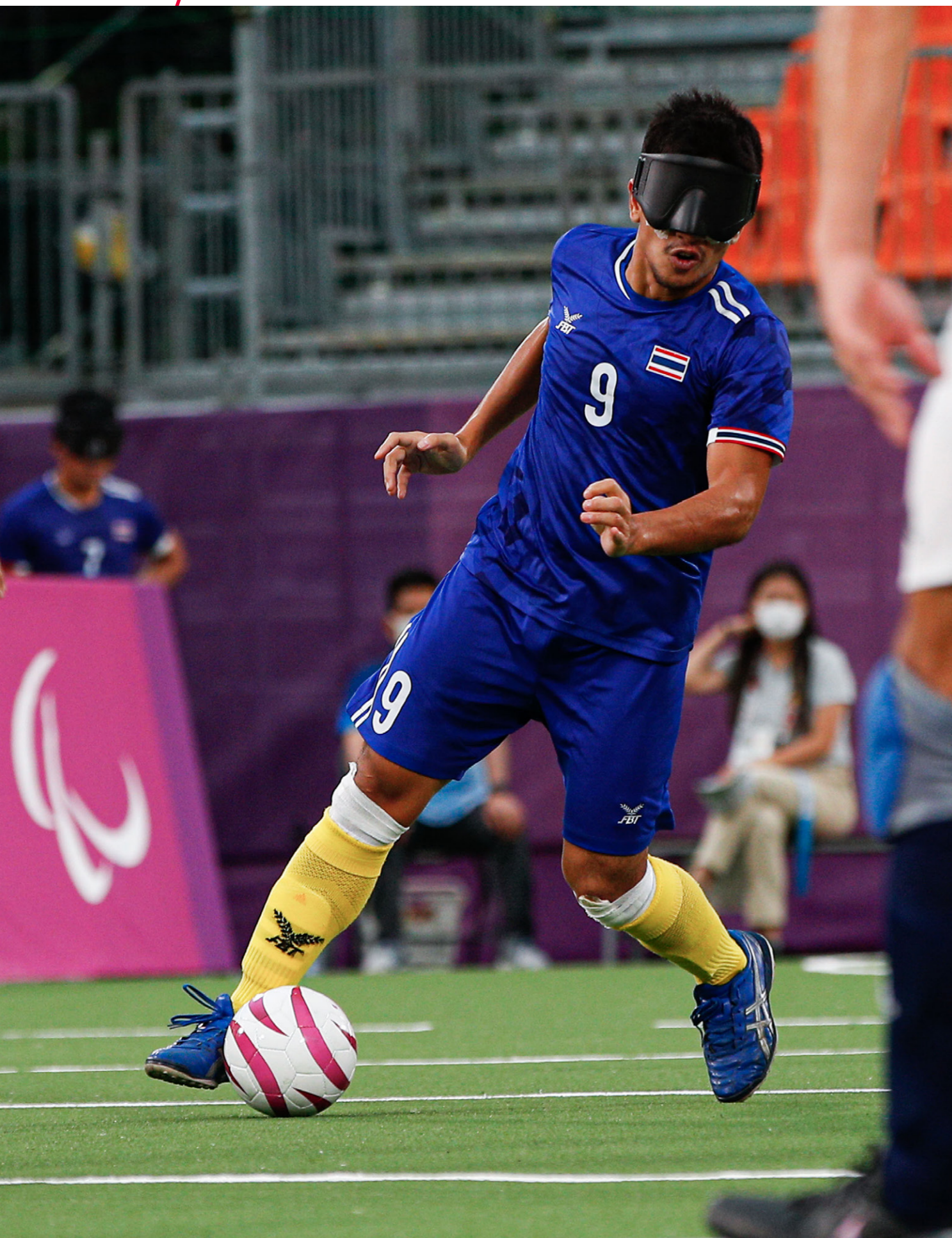
Blind Football being played in Tokyo, Image credit: International Blind Sports Federation